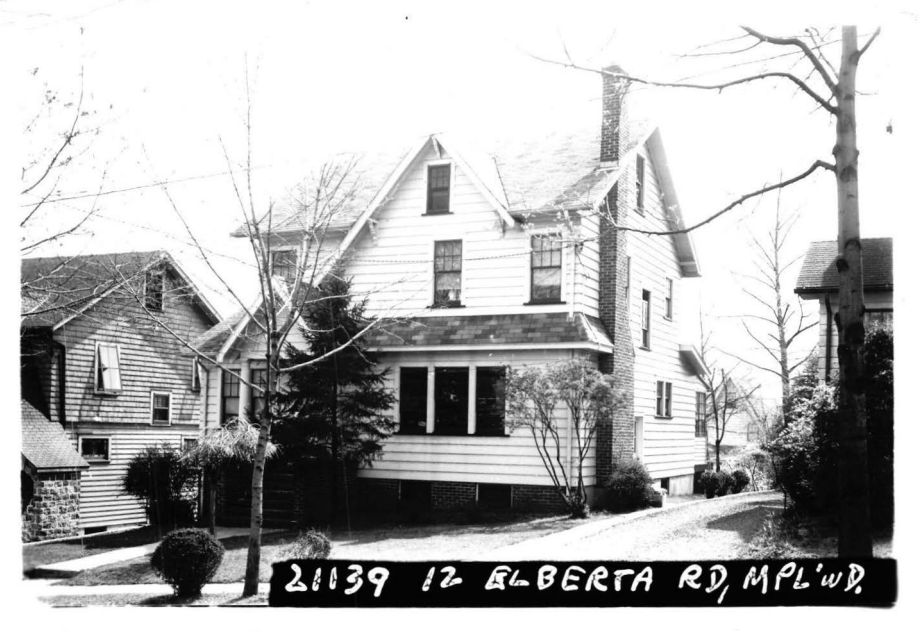
Board of Realtors of the Oranges and Maplewood